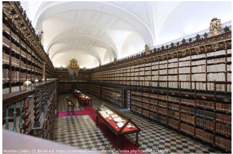
Matilde Colibri, CC BY-SA 4.0, https://commons.wikimedia.org/w/index.php?curid=59214016

Over 23K students every year Over 2K international students