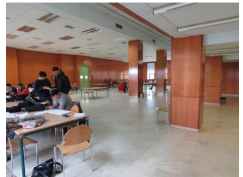
Large study & co-work room