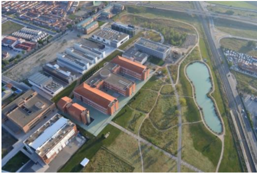
New building on campus